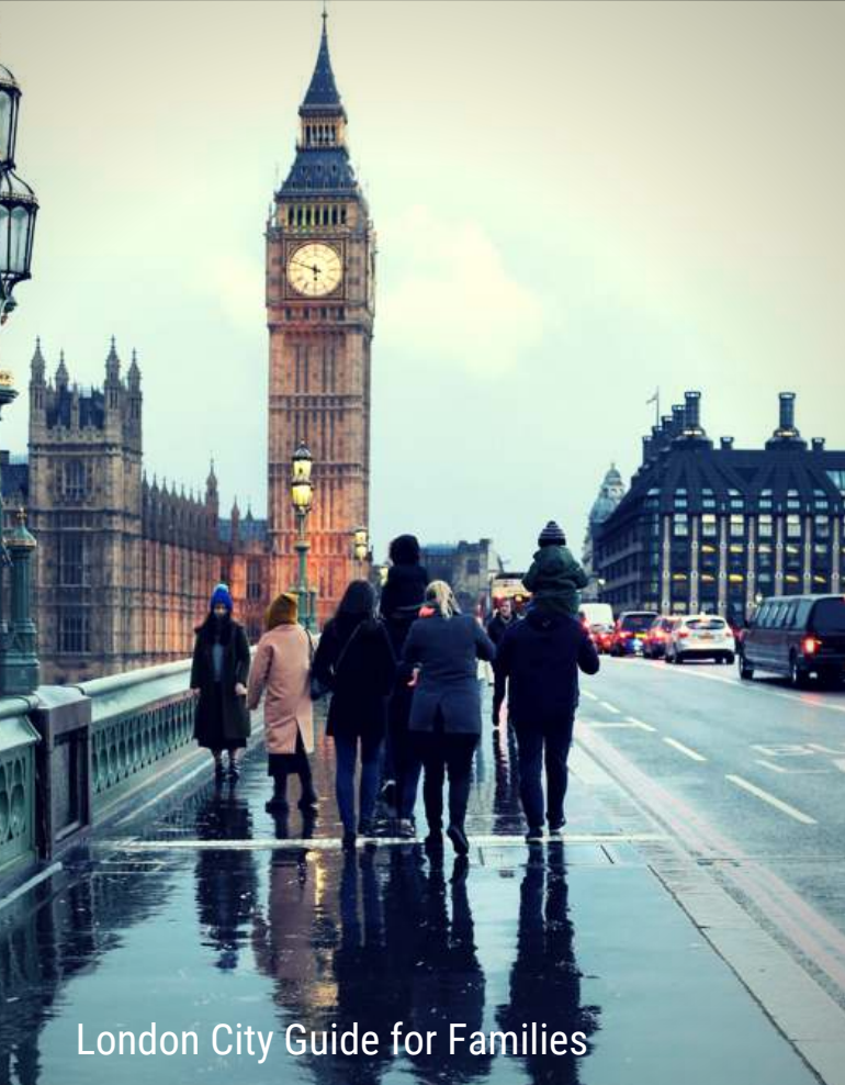
London City Guide for Families