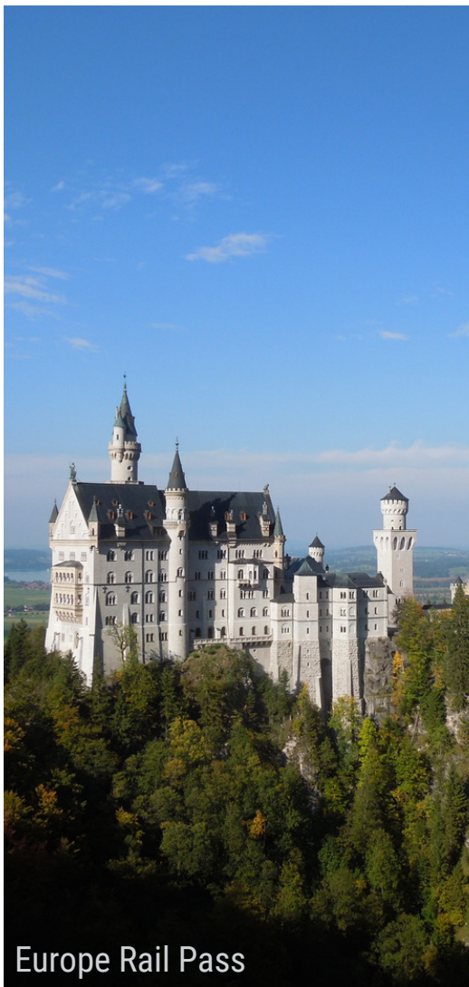
Europe Rail Pass