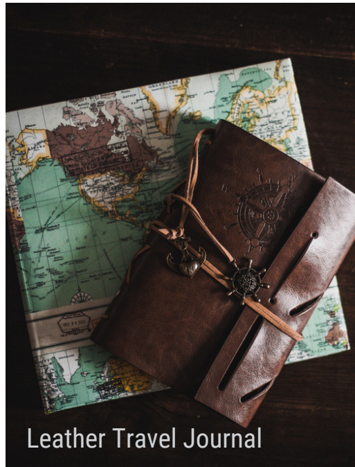
Leather Travel Journal