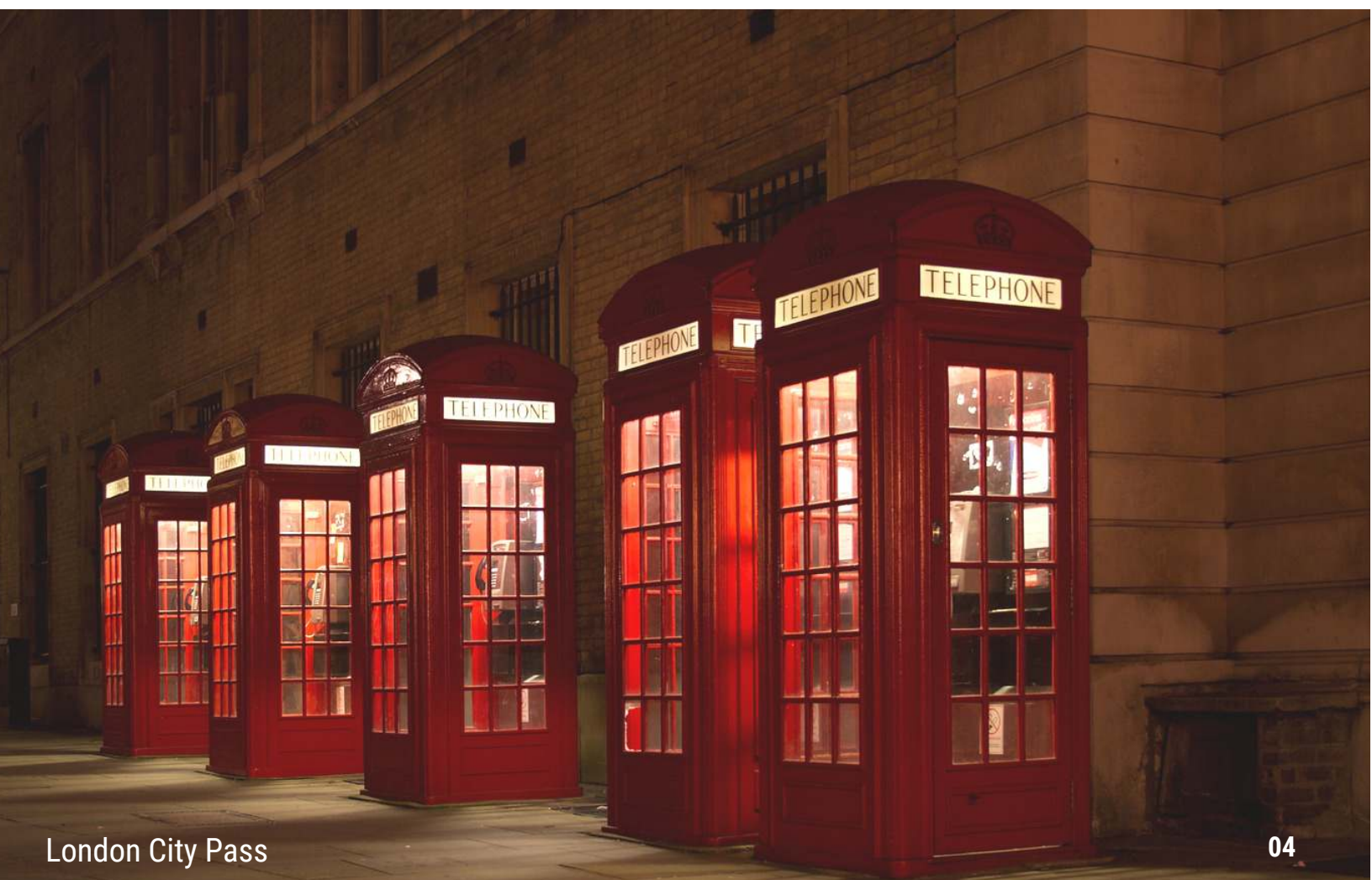
London City Pass

It takes a dream, a plan and a passion to go. This gift guide will help travelers ignite the dream, prepare the plan and find the gear to go wherever your travel dreams take you.